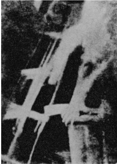
Carpenter Sawing 1913